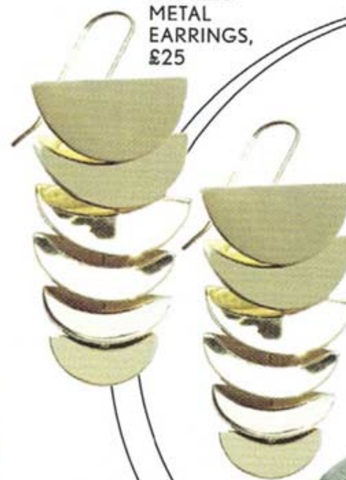
& OTHER STORIES METAL EARRINGS, £25