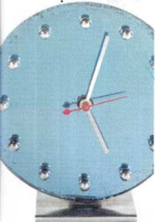
GLASS AND CHROME, FROM £2,247