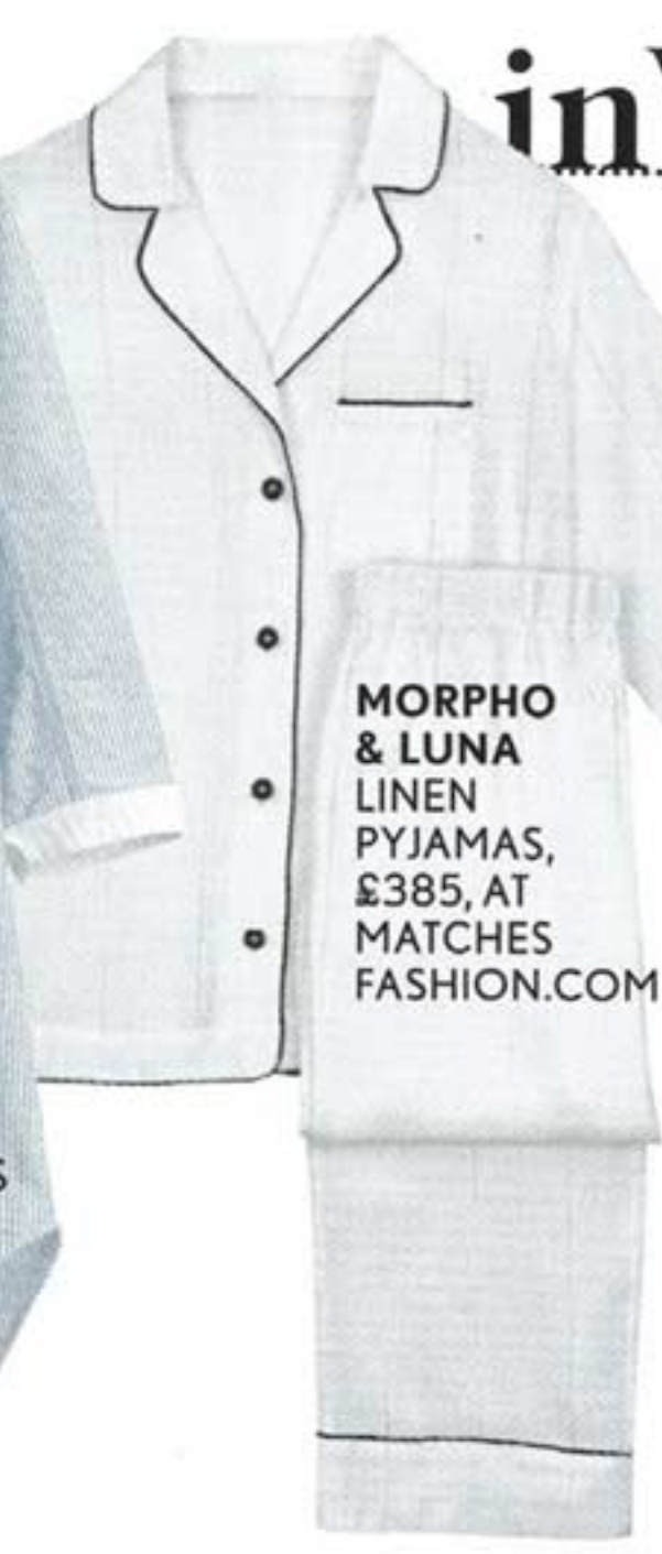
MORPHO & LUNA LINEN PYJAMAS, £385, AT MATCHES FASHION.COM