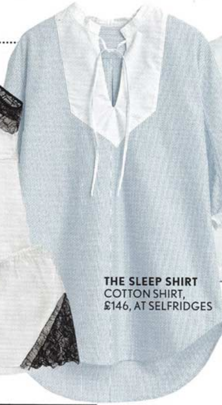
THE SLEEP SHIRT COTTON SHIRT, £146, AT SELFRIDGES