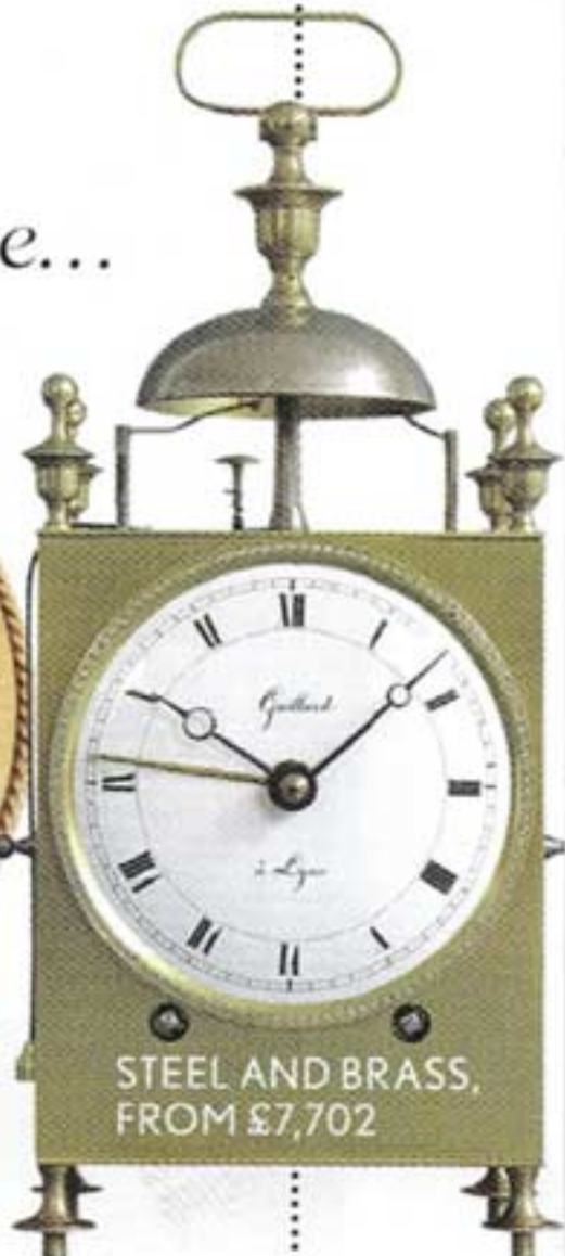
STEEL AND BRASS, FROM £7,702