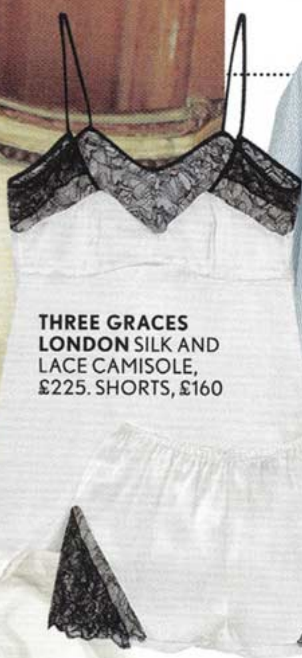
THREE GRACES LONDON SILK AND LACE CAMISOLE, £225. SHORTS, £160