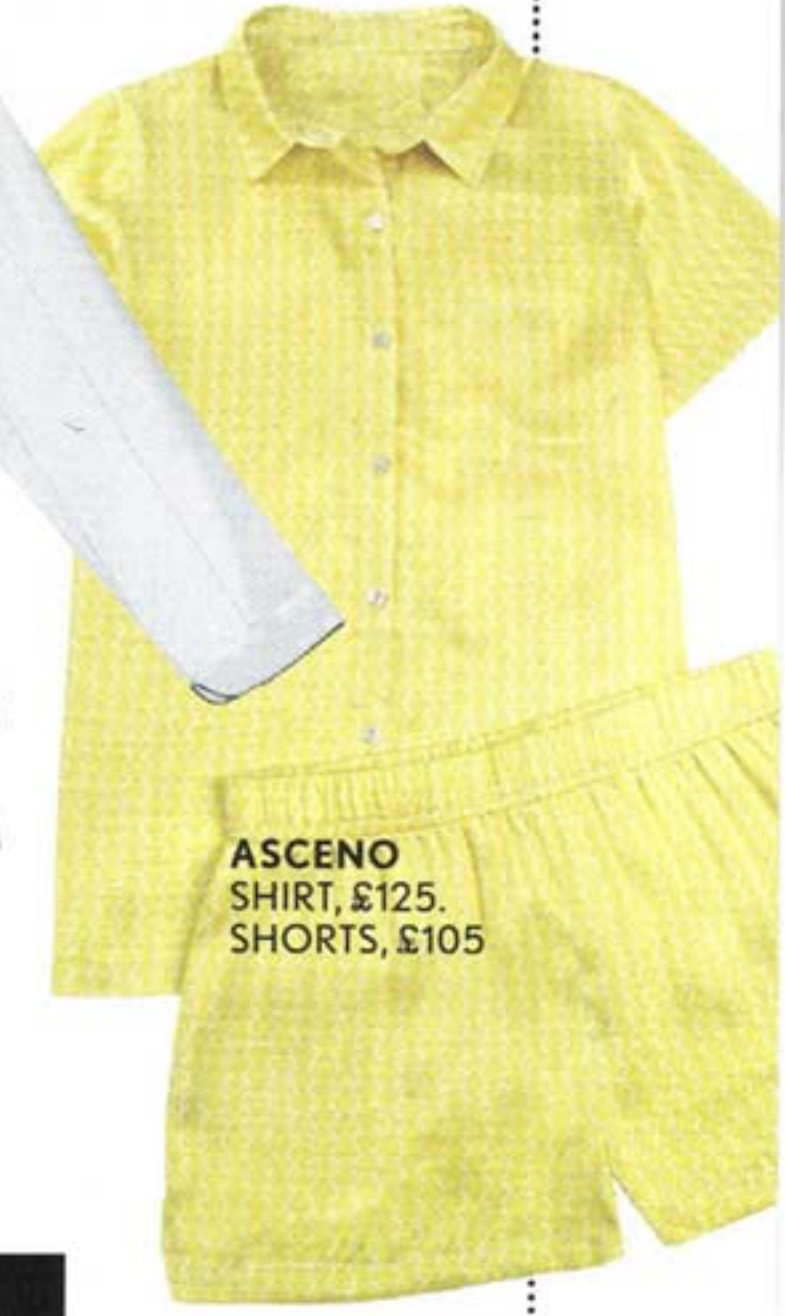
ASCENO SHIRT, £125. SHORTS, £105