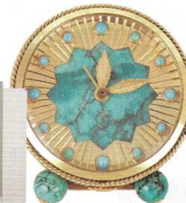
TURQUOISE, FROM £25,297