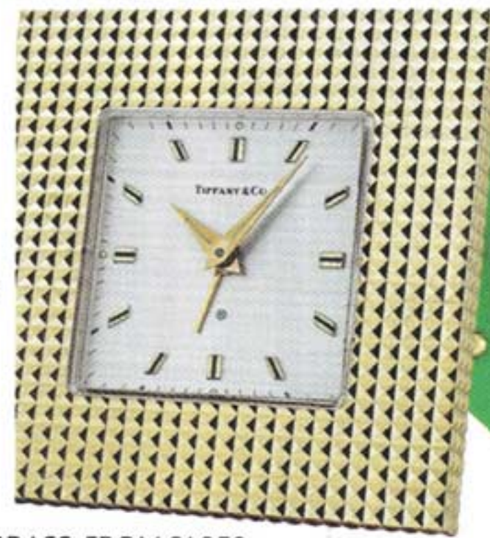
BRASS, FROM £1,952

Banished iPhones from the bedroom in an attempted digital detox? Revive the lost joy of waking up to a trill with a vintage alarm clock from 1stdibs.com.