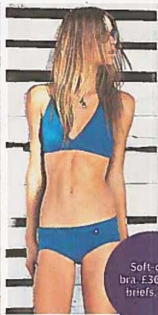
Soft-cup bra, £36, and briefs, £22

More fool Bendon. Macpherson's knowledge of her product has always