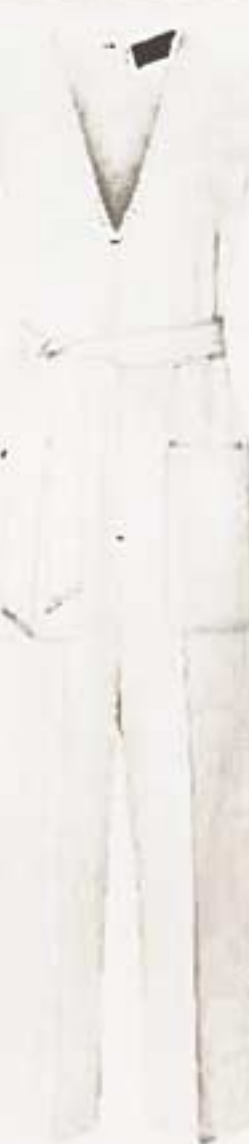
By Malene Birger stretch-crepe jumpsuit, £375