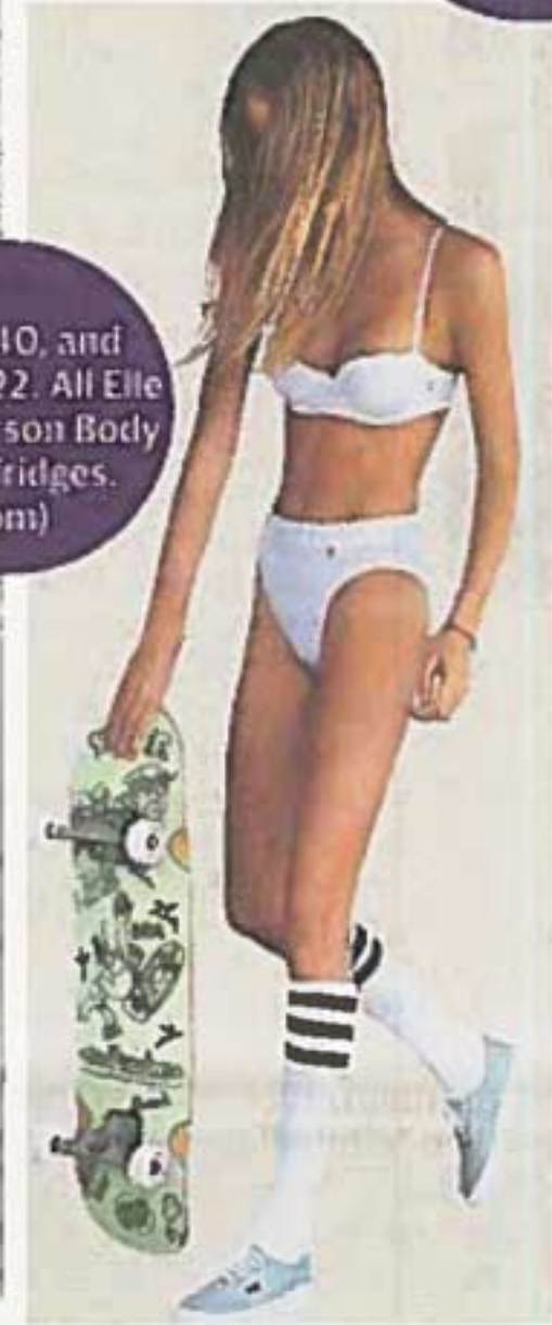
Bra, £40, and pants, £22. All Elle Macpherson Body at Selfridges. (cont)