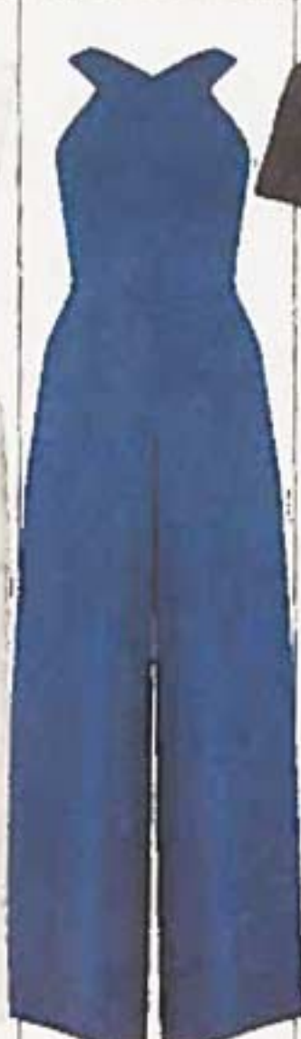
Wide-leg jumpsuit, £65 (warehouse.)