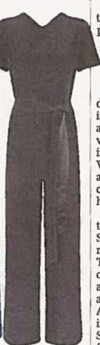
Pleated-back jumpsuit, £199 (jaeger.co.uk)

thing about trousers is, they're a self-perpetuating solution. Once you've got into their stride, who can be bothered with the saga of tights and finding the right length coat that are part of wearing a skirt or dress in winter?