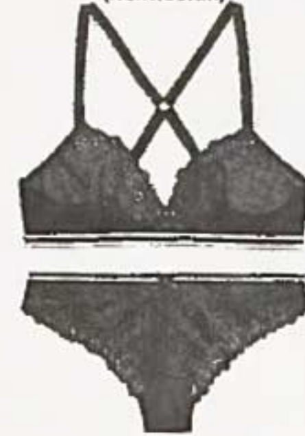
Yuma bra, £118, and Amy culottes, £84 (morphoandluna.com)