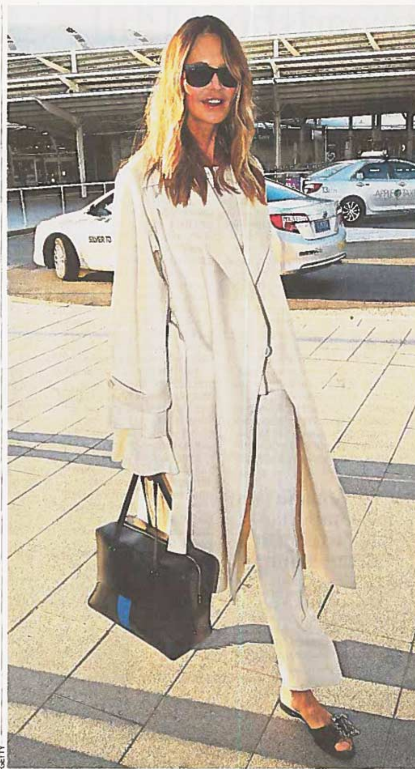
'I feel I have to try less hard in many ways now to be seductive,' says Macpherson

The new Elle Macpherson line isn't just T-shirt bras, but it is streamlined, fashion-conscious (she studied the colours currently in favour at Céline and Gucci) and feminine. "There are subtle and varied ways to be sexy, and an abundance of bows no longer seems to be one of them [she's replaced them with rose-gold rings that sit flat against the skin]. "Personally, I feel I have to try less hard in many ways now to be seductive, and I want to reflect